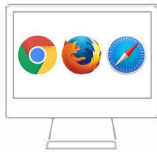
PC and Mac Chrome | Firefox | Safari